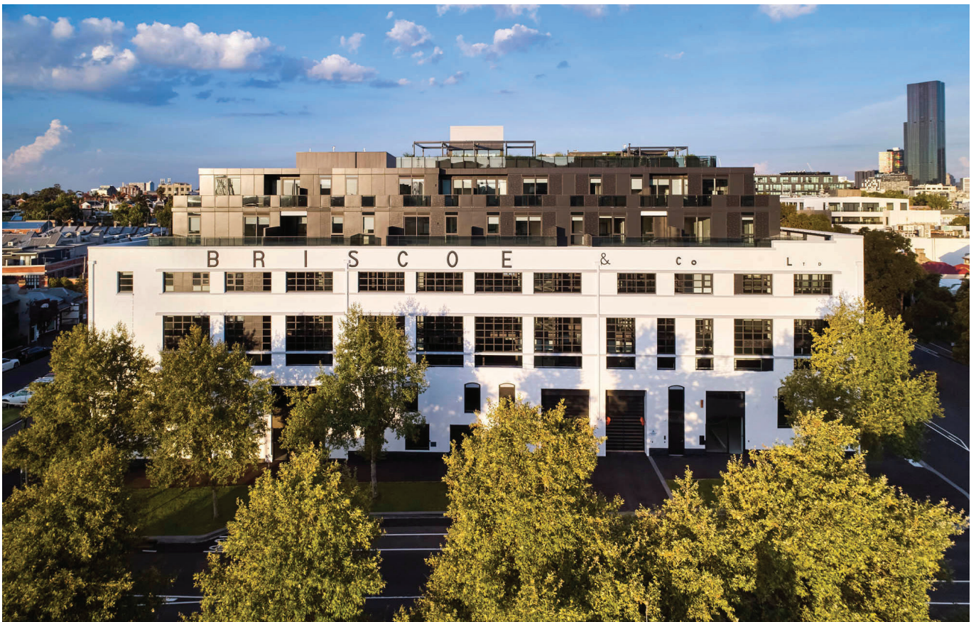
Sentinel Real Estate launched The Briscoe by Kinleaf in West Melbourne, Australia, in February 2024. The 172-home development offers premium and sustainable one-, two- and three-bedroom apartments for rent across its seven floors. Australian states and territories only lightly regulate rents.